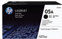
HP CE505D Dual Pack